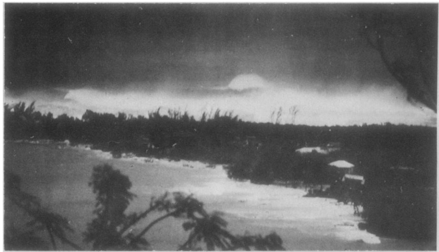
Fig. 2. Waves of Hurricane Allen breaking on East Fore Reef at Discovery Bay (Fig. 1, location E) at 0700, 6 August 1980. Wave heights were calculated to be 12 m; trees on shoreline are 15 m high.

Differences in damage to different growth forms (7) were particularly striking for corals, whose skeletal morphologies include branching, foliaceousness, encrusting, and head forms. As reported previously (5), branching species were more susceptible to hurricane damage than were massive heads (Fig. 4B). In an extreme example, at a depth of 6 m on