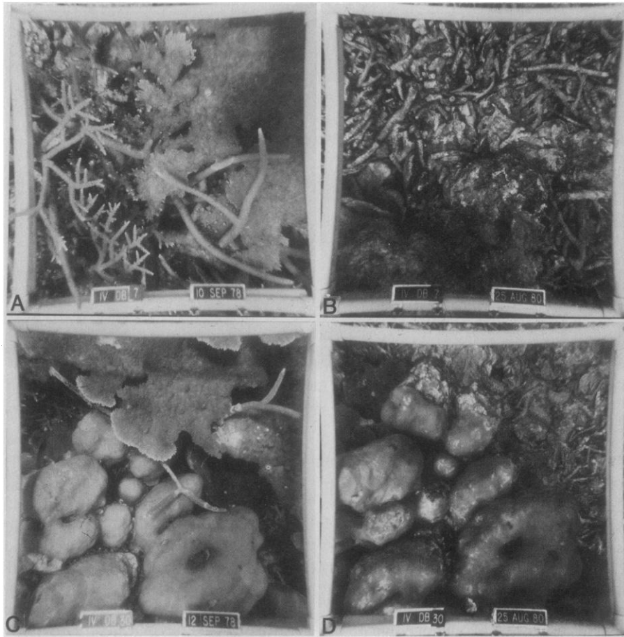
Fig. 3. Photostation on Monitor Reef (Fig. 1, location C; depth 6 m) before (September 1978) and 19 days after Hurricane Allen (each photograph 1/4 m 2 ). (A) Branching Acropora palmata (upper right), A. prolifera (lower left), and A. cervicornis (lower right) before Hurricane Allen. (B) The same quadrat after the hurricane showing total destruction of Acropora spp. (C) Acropora palmata overtopping massive Montastrea annularis before Hurricane Allen. (D) The same quadrat after the hurricane showing removal of A. palmata and lesions on M. annularis .